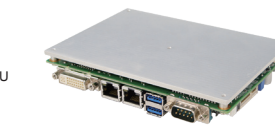
IPC-B3W8908 with Heat spreader